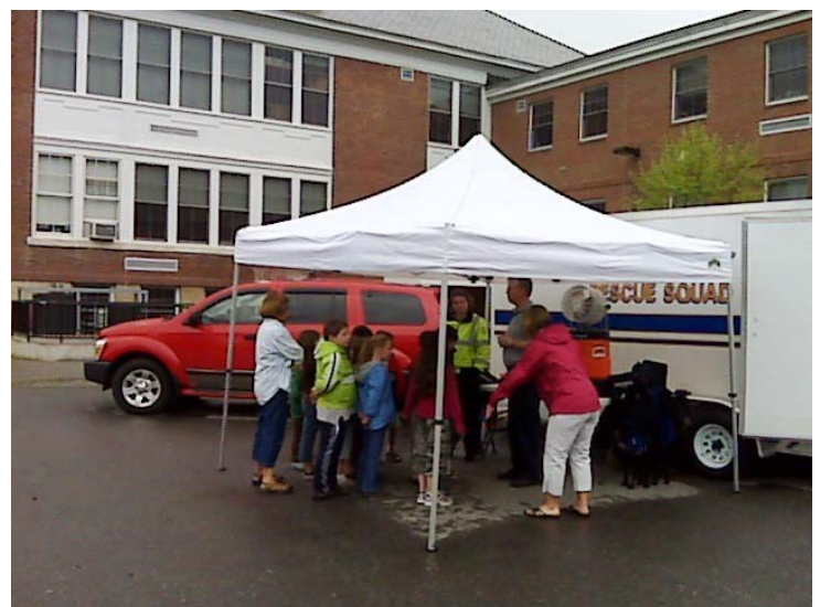
Cambridge Rescue at Cambridge Elementary School for EMS Week in May