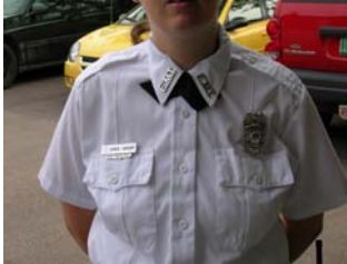
PROPER UNIFORM HARDWARE LAYOUT

As a reminder, each year Cambridge Rescue joins in the July 4 th festivities in a number of ways. Our day starts with all members assembling at the station beginning at 9am.